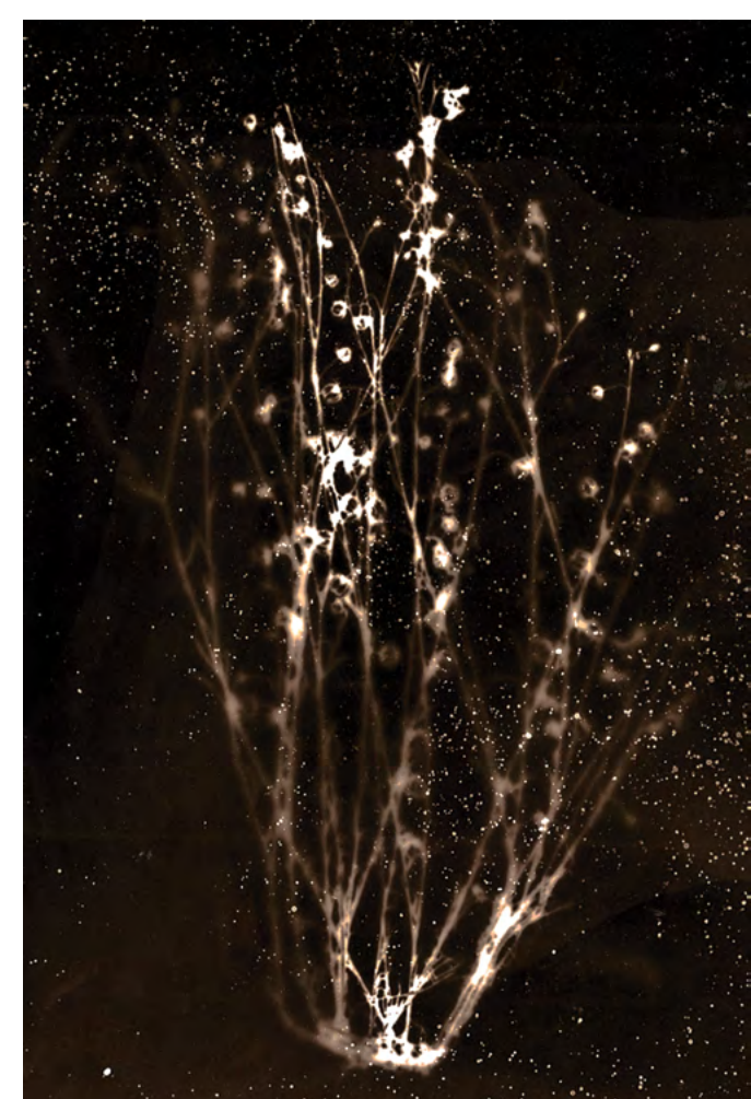
Linum usitatissimum Byrsonima lucida