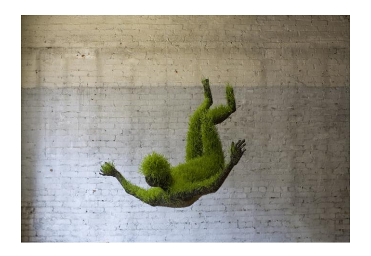
25.08.79 #1 (2010). Soil, wheat seeds, recycled metal, fabric. © Mathilde Roussel. All rights reserved.

grow, resembling hair, the figures appeared even more human. It is not difficult to guess how the display evolved thereafter. Without outside interference, the grass gradually swallowed up the human shapes it had previously outlined, and leveled down differentiations (as it always does). For once, humans proved to be literally and conceptually lower than vegetation, which they provided with a material foundation and to which they bowed, accepting the untamable exuberance of plant life.